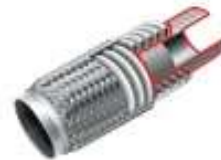
Con forro interior de anillos entrelazados